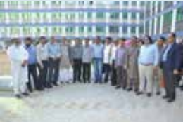
WMO collaborated with NCT to provide 60 homes at Taybah Residence in Ahmedabad, Gujarat to the deserving.