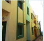
MEHKAR Housing Project, Maharashtra.