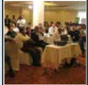
IYC 1 - Sri Lanka