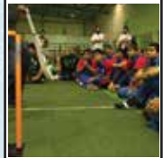
ISF 2013 - Middle East