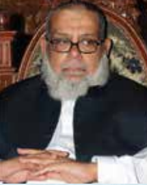
Late Abdul Razzak Yaqoob Gandhi ARY